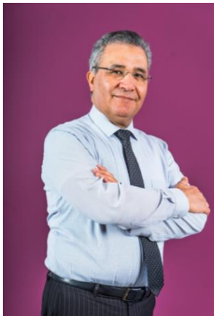
Chairman of the Management Board