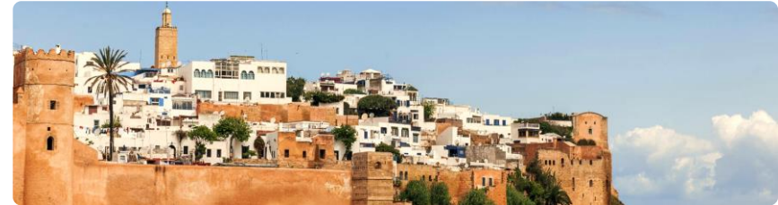
Kasbah of Oudayas

It has been the seat of Mohammed V University and several cultural and educational institutes, such as IFF since 2015 .