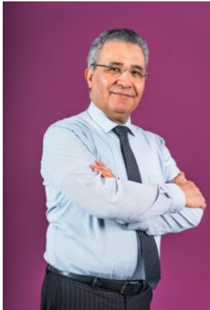
Chairman of the Management Board